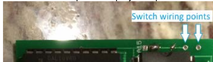
Figure 2 –A15 default permanent Tempest operation

The default configuration of the adapter is to play Tempest and looks as pictured below