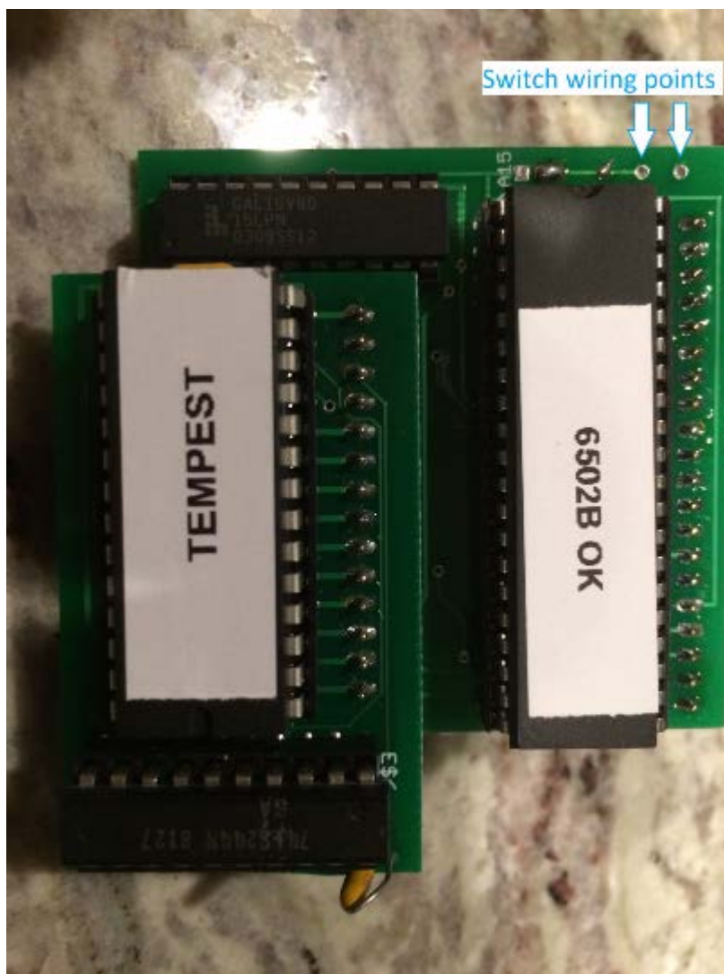
Figure 1 – Image of TEMPEST-DUAL-DB v1.0 PCB board. Note the 6502 CPU is NOT included and shown only for reference